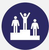
Events & Challenges