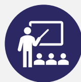
Safe Routes to School